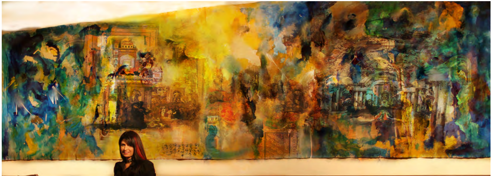
Ego vs Empathy, 2013, mixed media on canvas, 150x540cm. Courtesy of the artist.

This article was first published in HotWhite Magazine - November 2013.