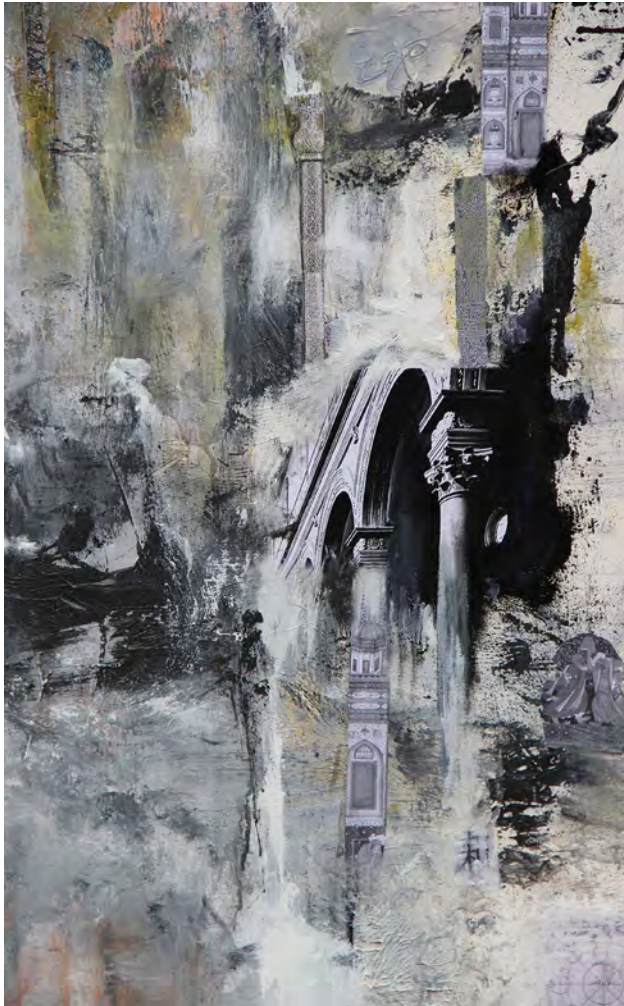
Good to Bad, 2013, mixed media on canvas, 150x120cm.

tugging at my attention and creating a sense of urgency. Good to Bad, an ungarbled, direct visual message, was my favorite of all the works. I felt drawn toward the top right corner past a lone abstract constellation on the top center by a lightning bolt or a laser beam under cloud cover reaching from a crystal clear collage in the foreground of two hallways, one symmetric and one not, grounded against a storm of black and white shapes with occasional suggestions of pinks or greenish browns further back. Finally, scratched into the thick white paint above the foreground arch in script is the word “ego.” Unburdened by the self, like a song by Jimmy Cliff or The Who, I could see clearly now; I could see for miles into a unique world the painter inhabits.