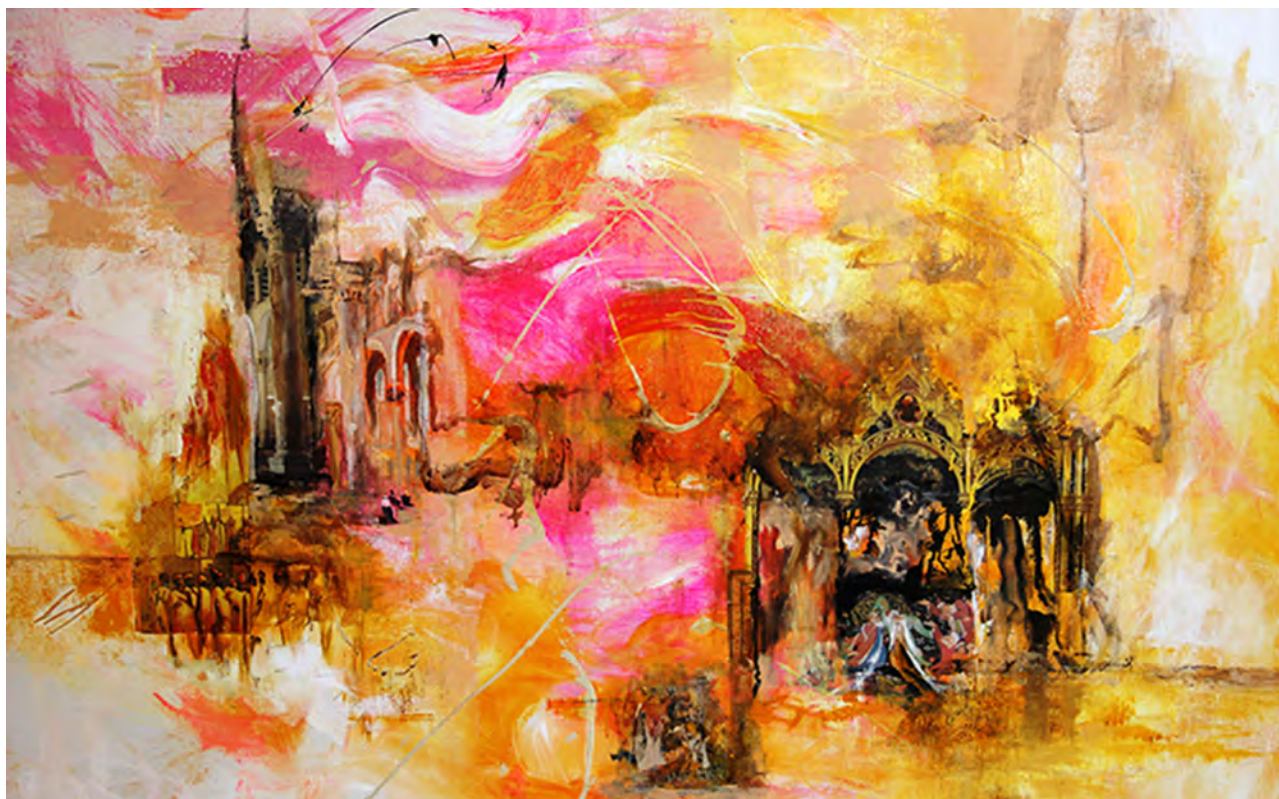
Spirit of Dreams, 2012, mixed media on canvas, 120X150cm.

a cityscape left behind. Drenched in cotton candy pinks and oranges, it is a half-stone, half-gingerbread construction suggestive of both Florine Stettheimer's High Modern series The Cathedrals of Art as well as Pozzo Andrea's 17th Century famous fresco depicting a wedding feast at Cana surrounded by painted marble arches, balustrades, pillars and columns—but with the wedding extracted and replaced by personal memories, mystical dreams and aspirations. It is as if Plato and Aristotle, the central figures in Raphael's The School of Athens in the Vatican, have been plucked away from their surroundings leaving only the brooding moods evoked by the haunted images of a Giorgio de Chirico cityscape. Here, de Chirico's Surrealist Italian piazzas and the bright daylight of Mediterranean cities have been replaced by Mughal and Ottoman motifs floating in the Gerhard Richter Abstracts that were created from black-and-white photographs during the 1960s and early 1970s. Richter's "blur" effect—with a soft brush and some aggression but not quite a squeegee—come